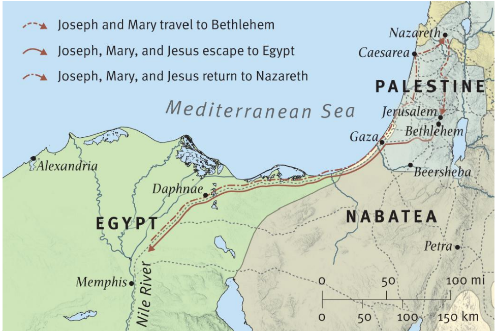
MAP 2 - BIRTH & FLIGHT TO EGYPT